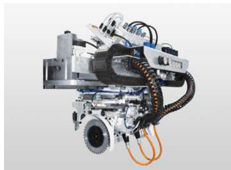
End Trimming Unit