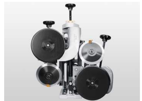
Fine Trimming Unit