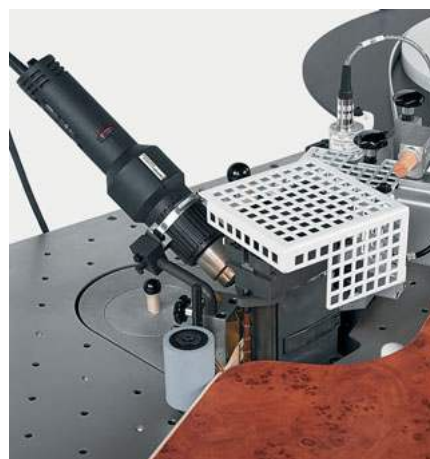
Additional heating unit (optional) To pre-heat thick PVC-edges.