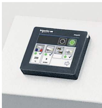
Intuitive operation via 3,5" touch display.