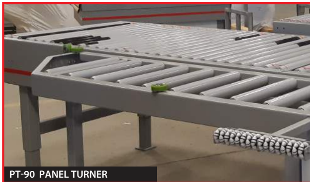
PT-90 PANEL TURNER