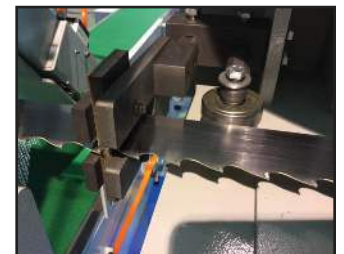
Heavy duty blade guides