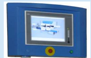
15" touch panel with separate control console