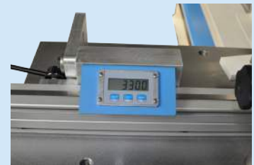
Digital read-out and one large swivelling back stop