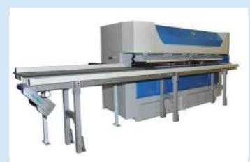
Automatic timber return system