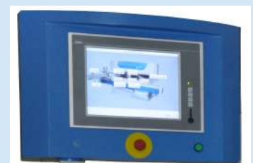
15" touch panel with separate control console