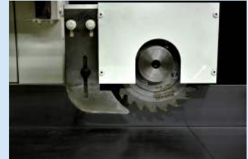
Glass bead saw