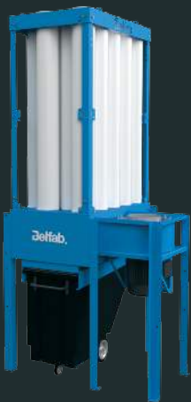
BEL 50XL or BEL 75XL

Discover the BEL Series by Belfab, the ultimate choice for dust collection. Ranging from 5 HP to 20 HP, it offers high efficiency and a full range of features. Designed in compliance with NFPA. Optimized for maximum performance, it includes dust disposal options that are engineered to minimize downtime. Ideal for wood dust, the BEL Series limits airborne particles, ensuring safety and a clean workspace. Trust Belfab for superior dust collection and a healthier work environment!