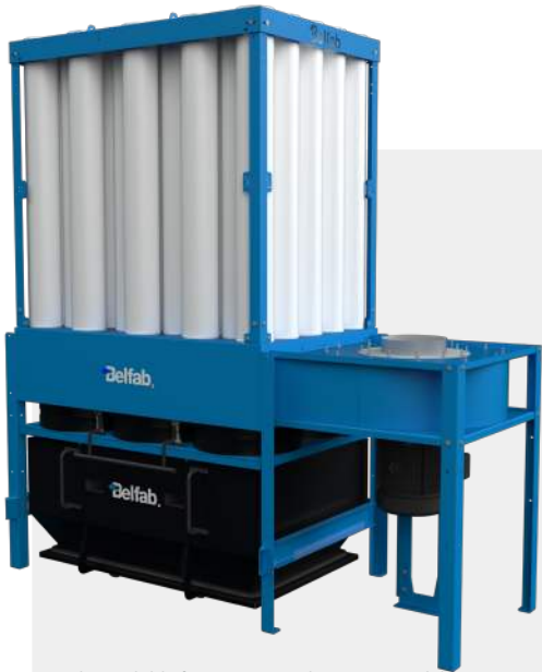
Only available for BEL 150 and BEL 200 models.

Our quiet Hummer blower, available from 10 to 20 HP. Our units are built with 14-gauge steel for durability and quiet operation. High-efficiency bean bag filters capture 99.99% of particles at 3.8 microns.