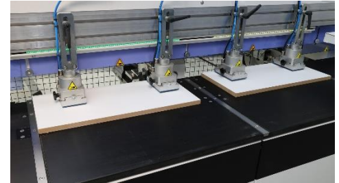
Reference stops - Machine controlled